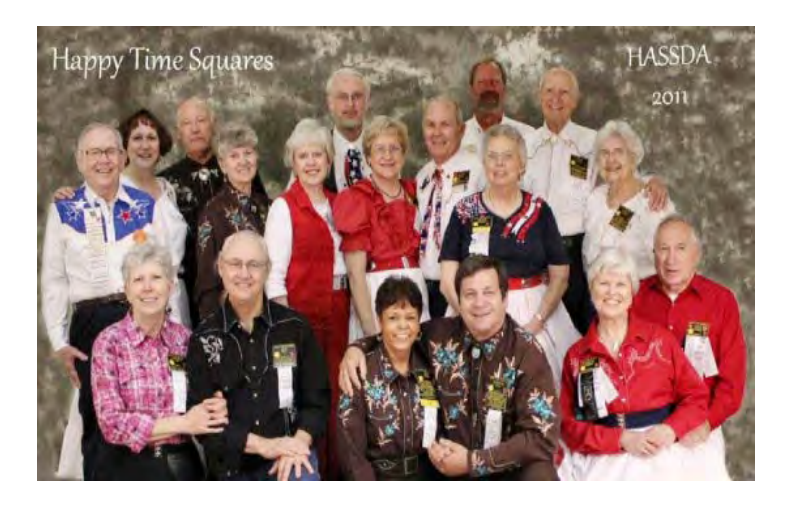
Group photo of attendees from Happy Times Squares in Lawrence, KS