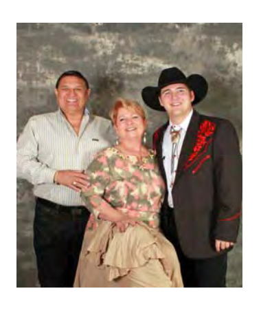
Where is Randy?