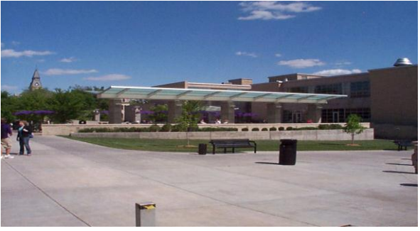
North entrance K-State Student Union showing the plaza

Parking on campus usually requires a permit. However, a permit is not required in parking lots after 5:00 p.m. Friday until 7:00 a.m. Monday. During this time, visitors may park in lots where signs designate "W","O", "T", or "Z". Approximately one block west of the Union is a parking lot which meets this criteria. A parking garage is also connected to the Union which operates 24/7. Daily permits there are $5.00.