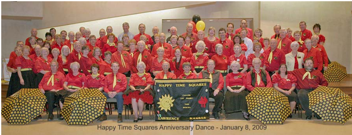
Happy Time Squares Anniversary Dance - January 8, 2009