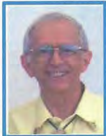
Rounds Cuer Stash Tosio